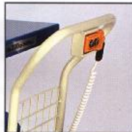
Removable Pendant Push-Button Control in Handle Mount (BXB)