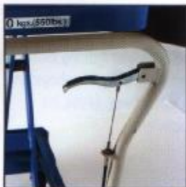
Convenient Hand-Lever Lowering Control For Model BX