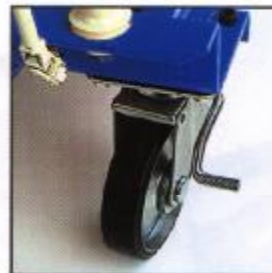
Dual-Action Caster Brake Locks Wheel and Swivel