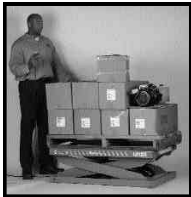
Easy power down functionality

QUICK-SHIP 48 Hours Lead Time Within the U.S. **